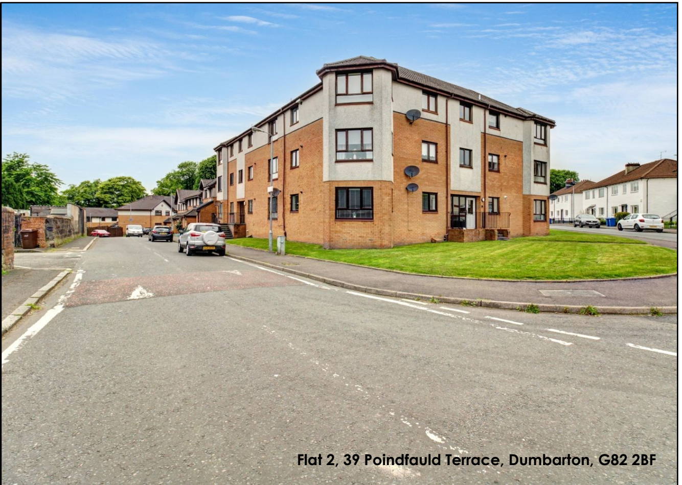
Flat 2, 39 Poindfauld Terrace, Dumbarton, G82 2BF

Set within a modern, well-kept block just moments from Dumbarton town centre, this bright and inviting ground-floor flat offers comfortable living in a highly convenient location. Everything you need is close by — shops, schools and Dumbarton Central station are all within easy reach.