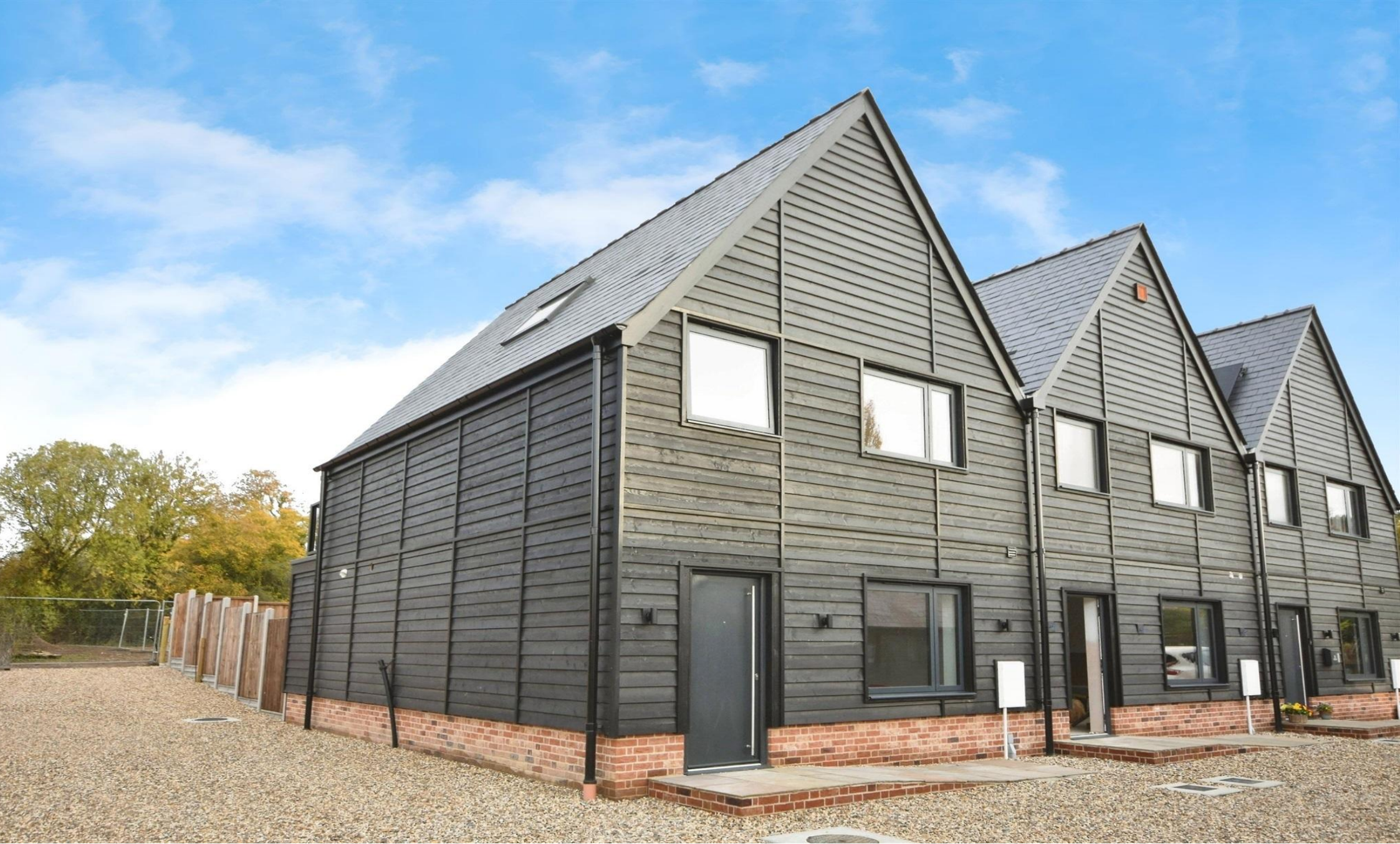
Coppins Yard, Colne Engaine, Colchester CO6 2FN