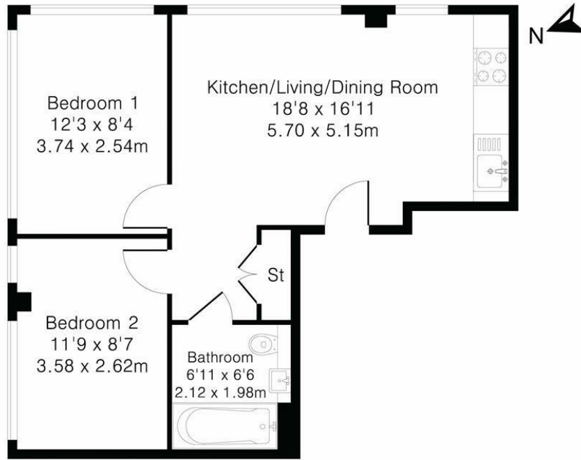
Fifth Floor Flat

Approximate Gross Internal Area 509 sq ft – 47 sq m