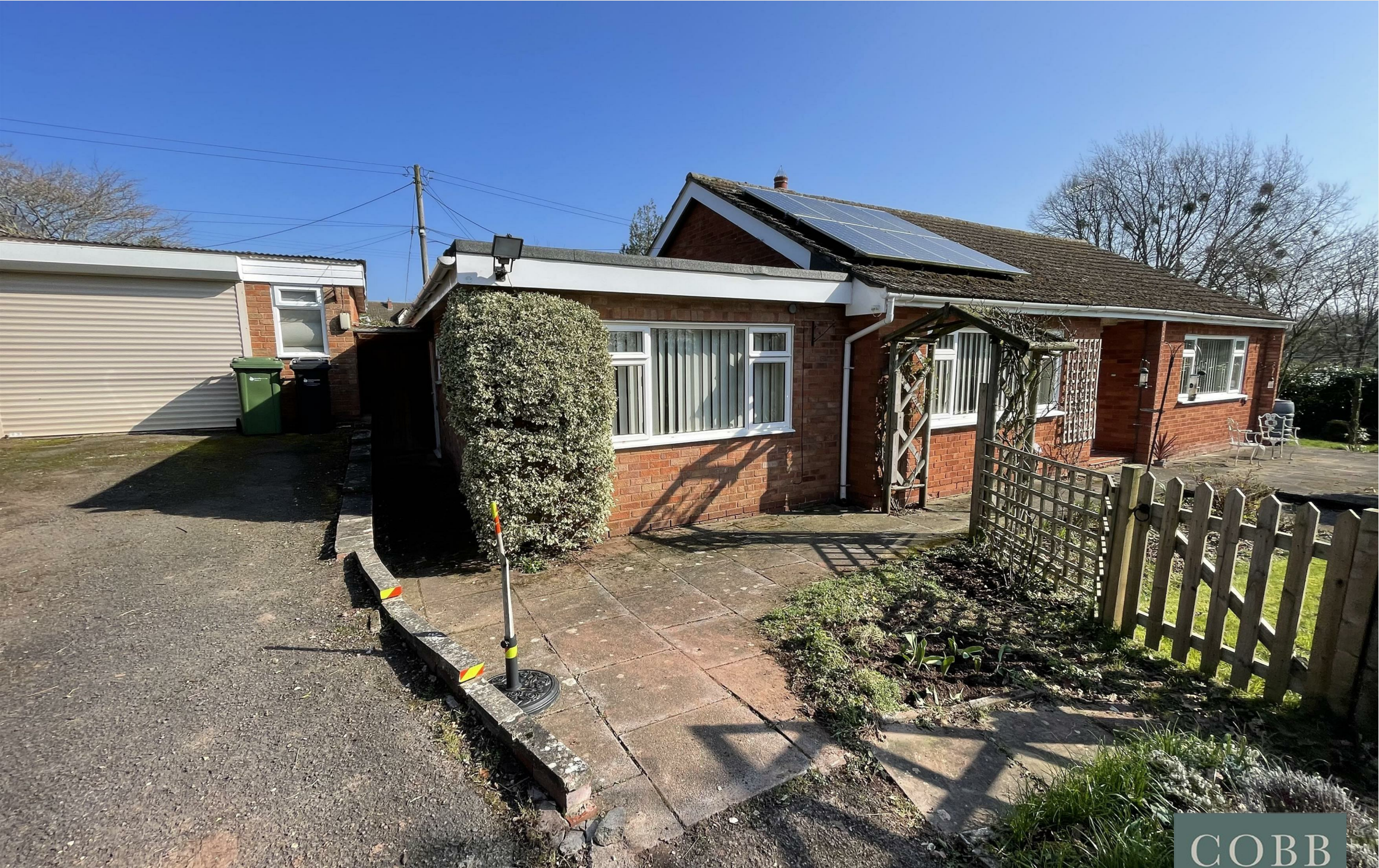
The Wickets, Llanwarne, Hereford, HR2 8JF Price £385,000