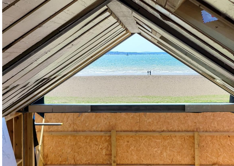
CHALET 34' 7" x 13' 1" (10.54m x 3.99m)