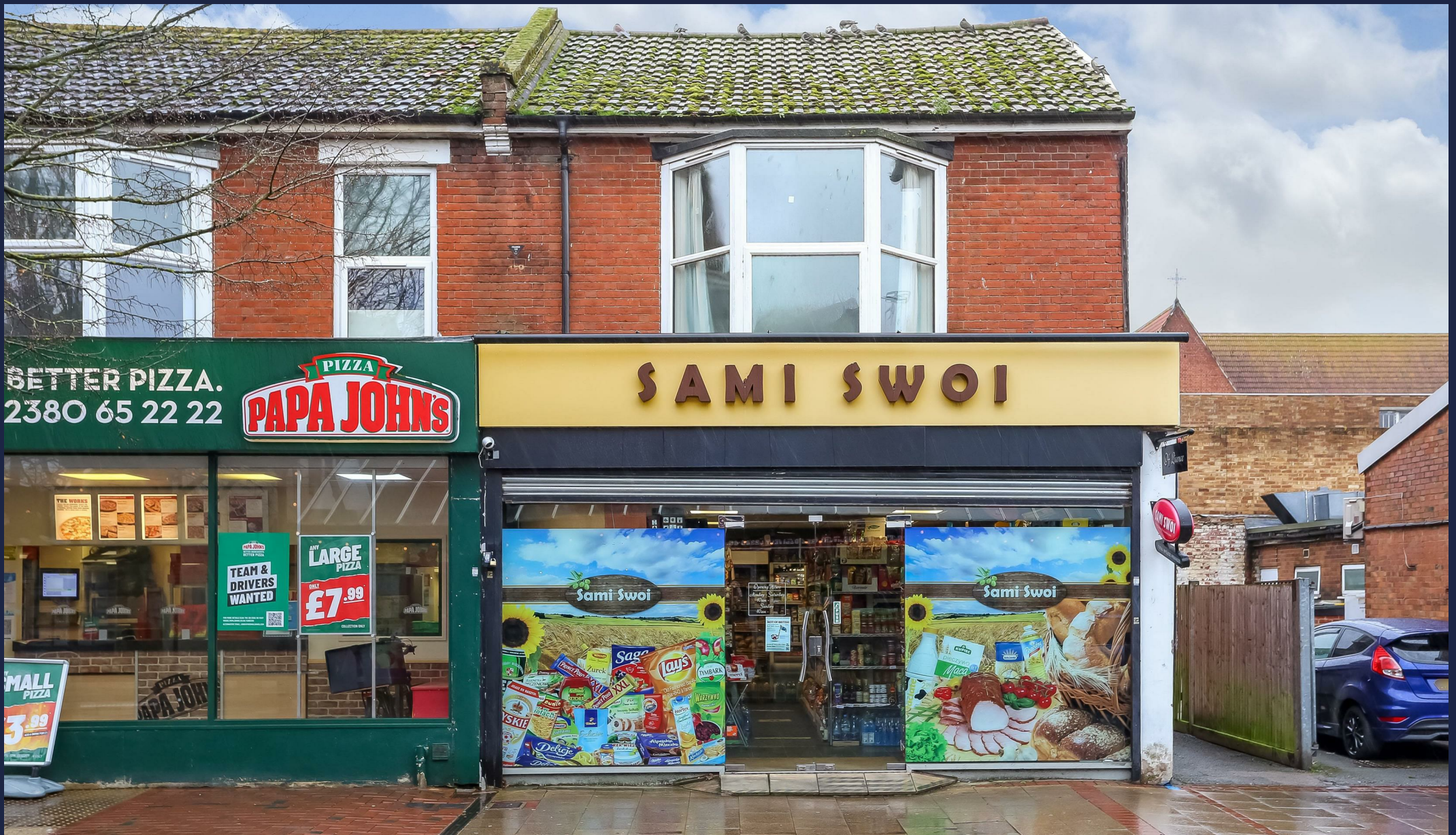
Flat 1b, High Street, Eastleigh