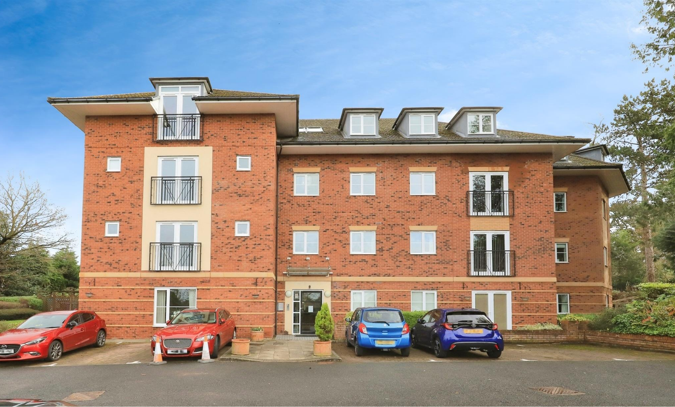
Pedmore Mews, Stourbridge, DY8 2PY