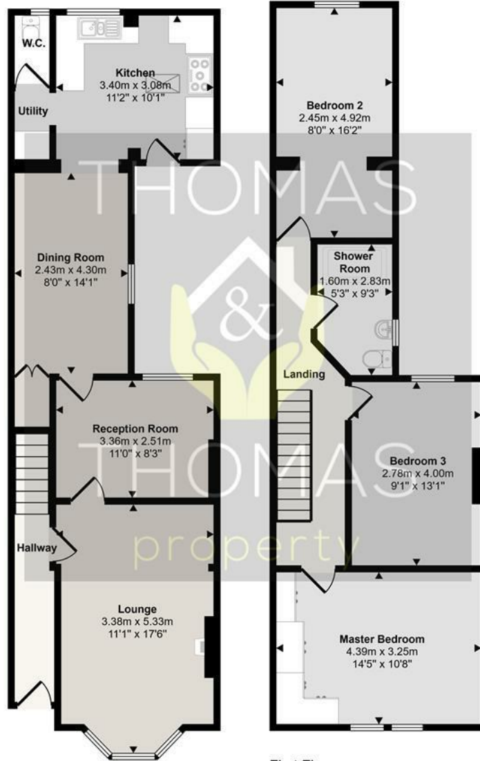
Ground Floor Approx 57 sq m / 611 sq ft

Approx Gross Internal Area 109 sq m / 1171 sq ft