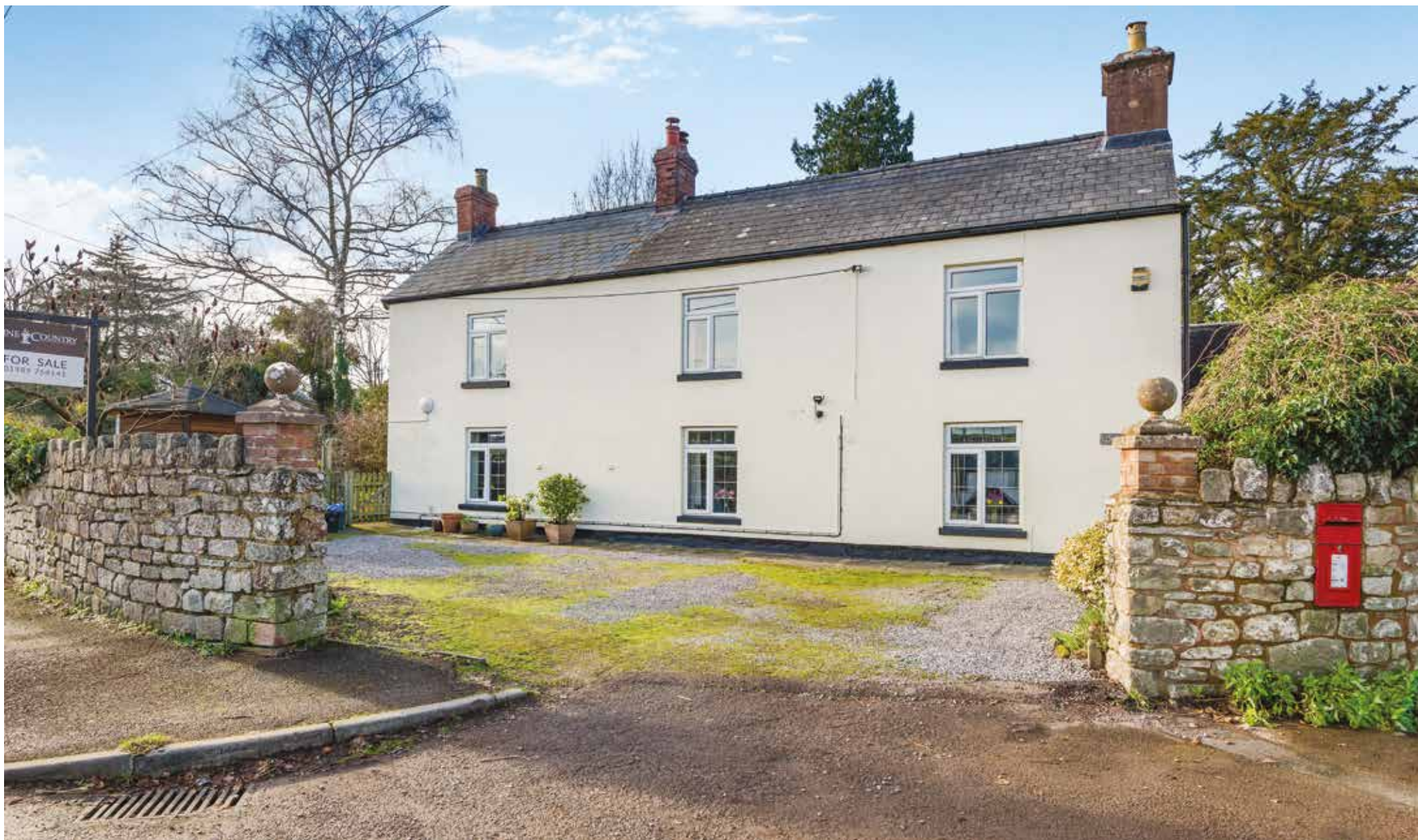
Church House English Bicknor | Coleford | Gloucestershire | GL16 7PG