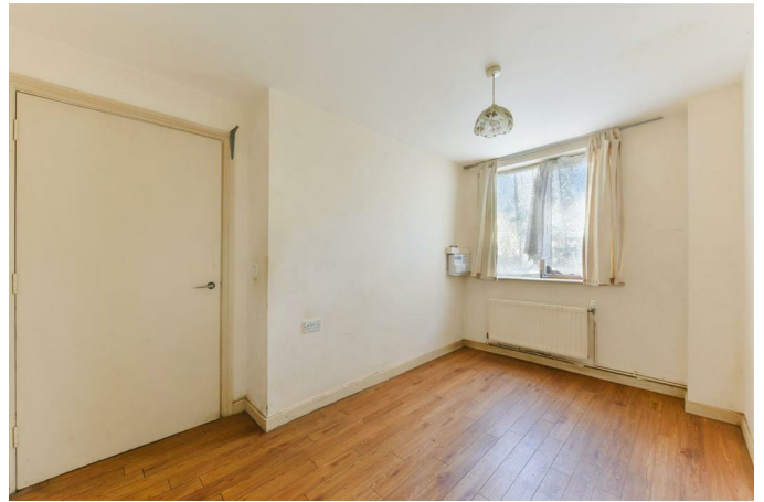
Kitchen Breakfast Room