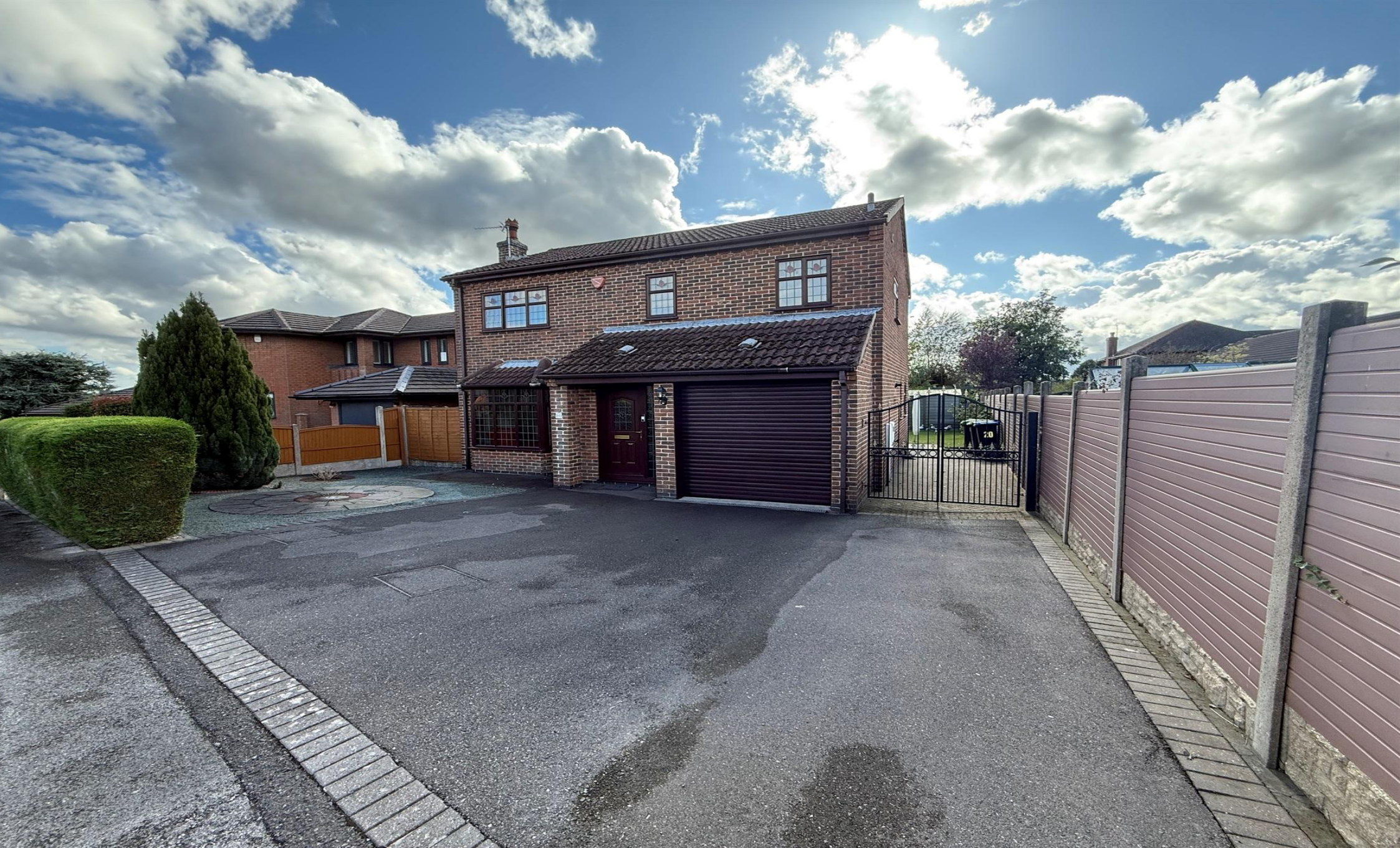
Sharrard Close Underwood Nottingham