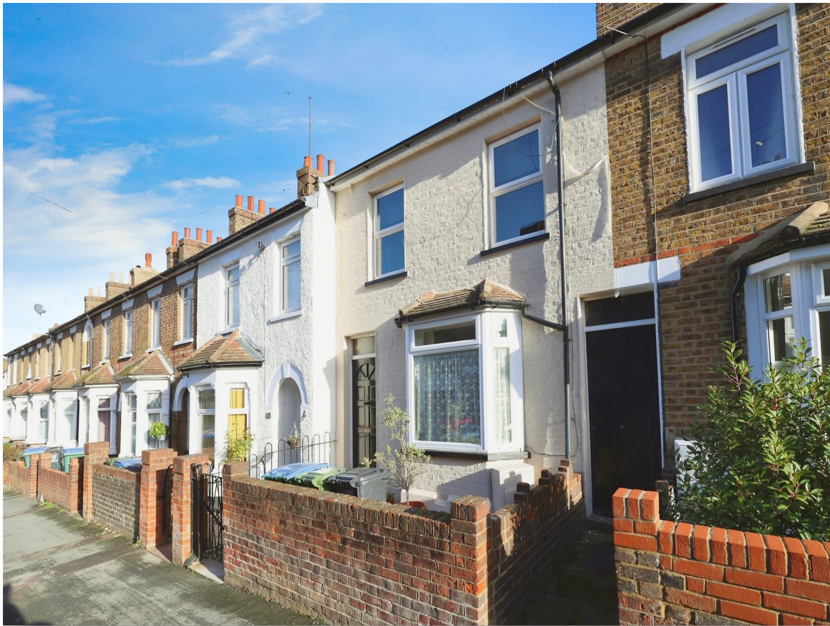
Estcourt Road, Watford, WD17 2PZ