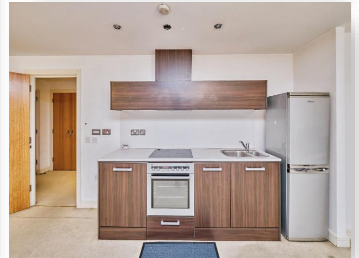
Islington Gates Fleet Street, Birmingham B3 1JL