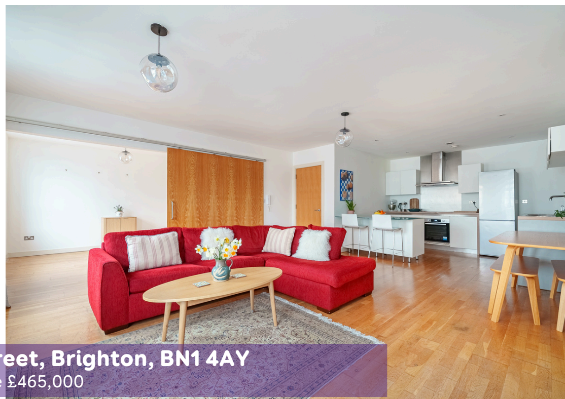
Argus Lofts, Robert Street, Brighton, BN1 4AY Asking Price £465,000