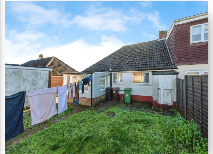
Romsey Road, Waterlooville PO8 0EA