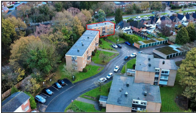
Trident Close, Sutton Coldfield, B76 1LF