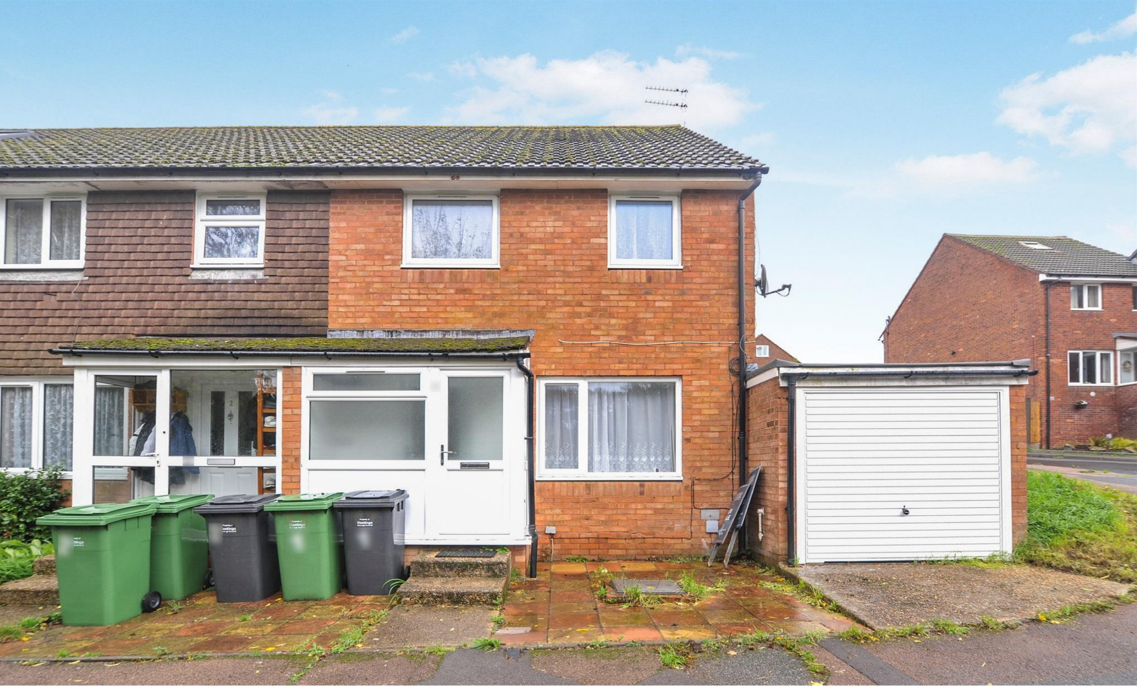
Dell Close, St. Leonards-On-Sea TN38 0YS