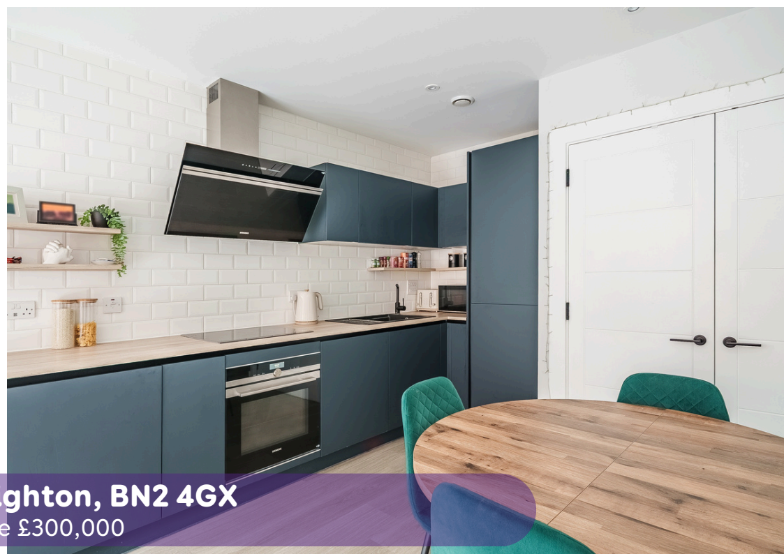
The Furlong, Brighton, BN2 4GX Asking Price £300,000