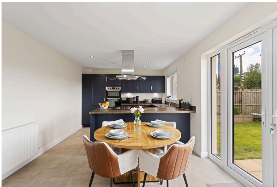
29 Bristonhill View, West Calder, EH55 8FT