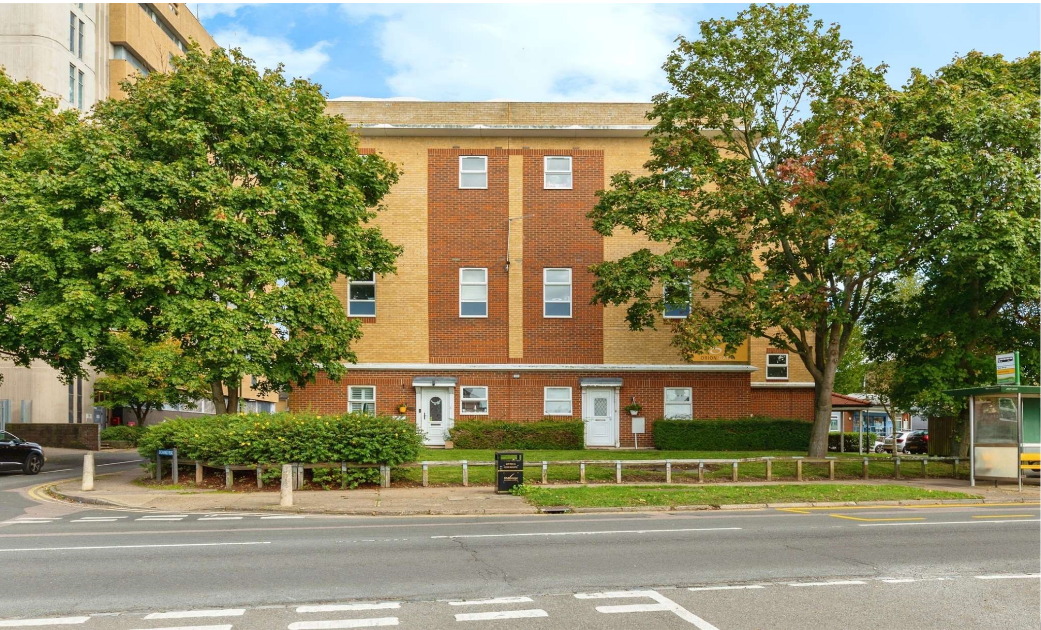
Orion Gate, Stevenage, SG1 1WZ