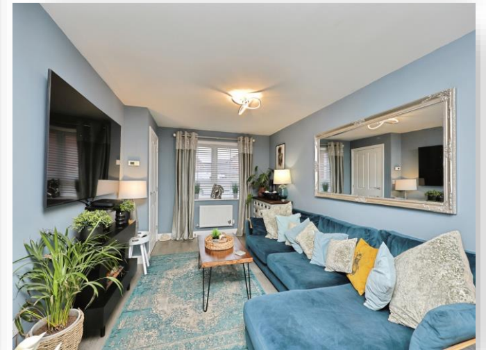
Angel Close, Watton Thetford IP25 6WW