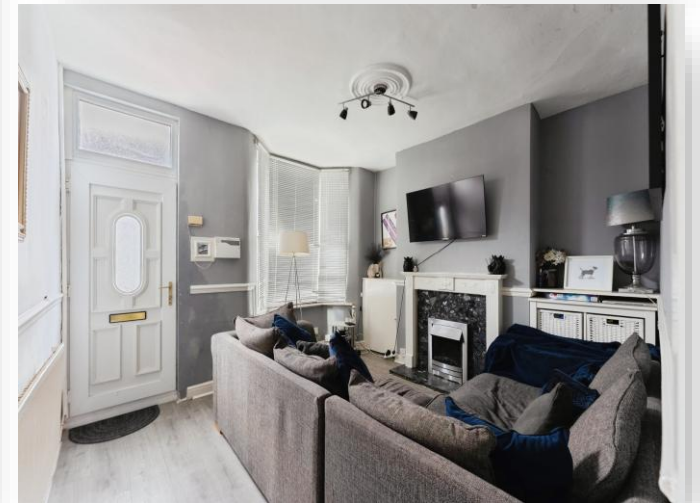
Moorland Road, Tranmere, Birkenhead, CH42 5NU