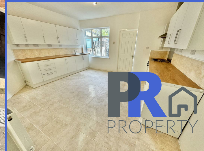
52 Chiltern Road, Dunstable, LU6 1ER £1,600