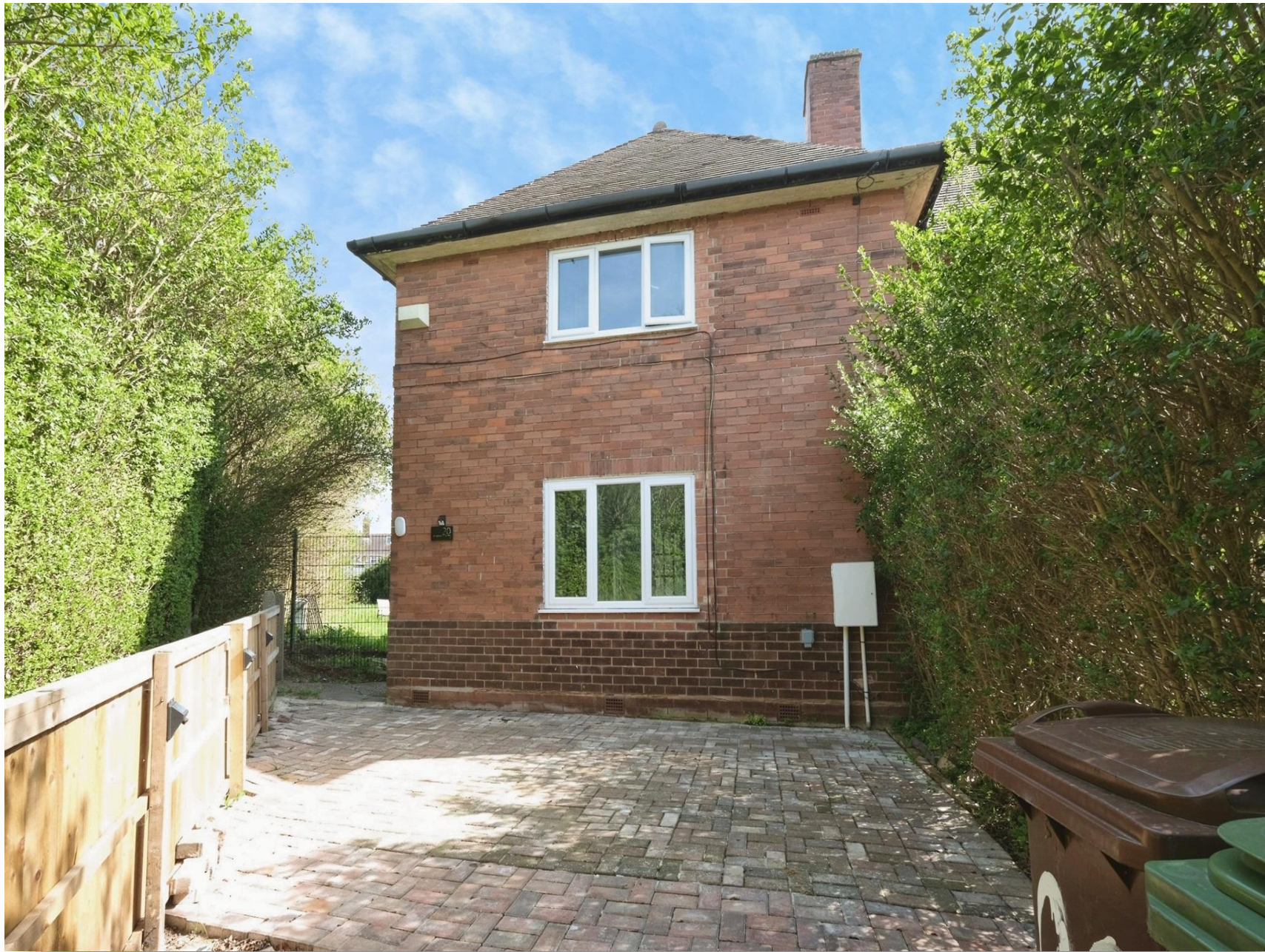
Bracken Close, Nottingham NG8 3AN