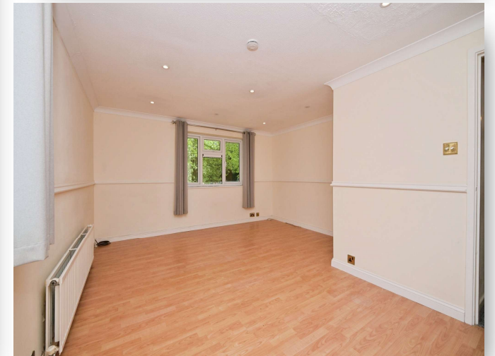
Dellfield, Wadesmill Ware SG12 0TB