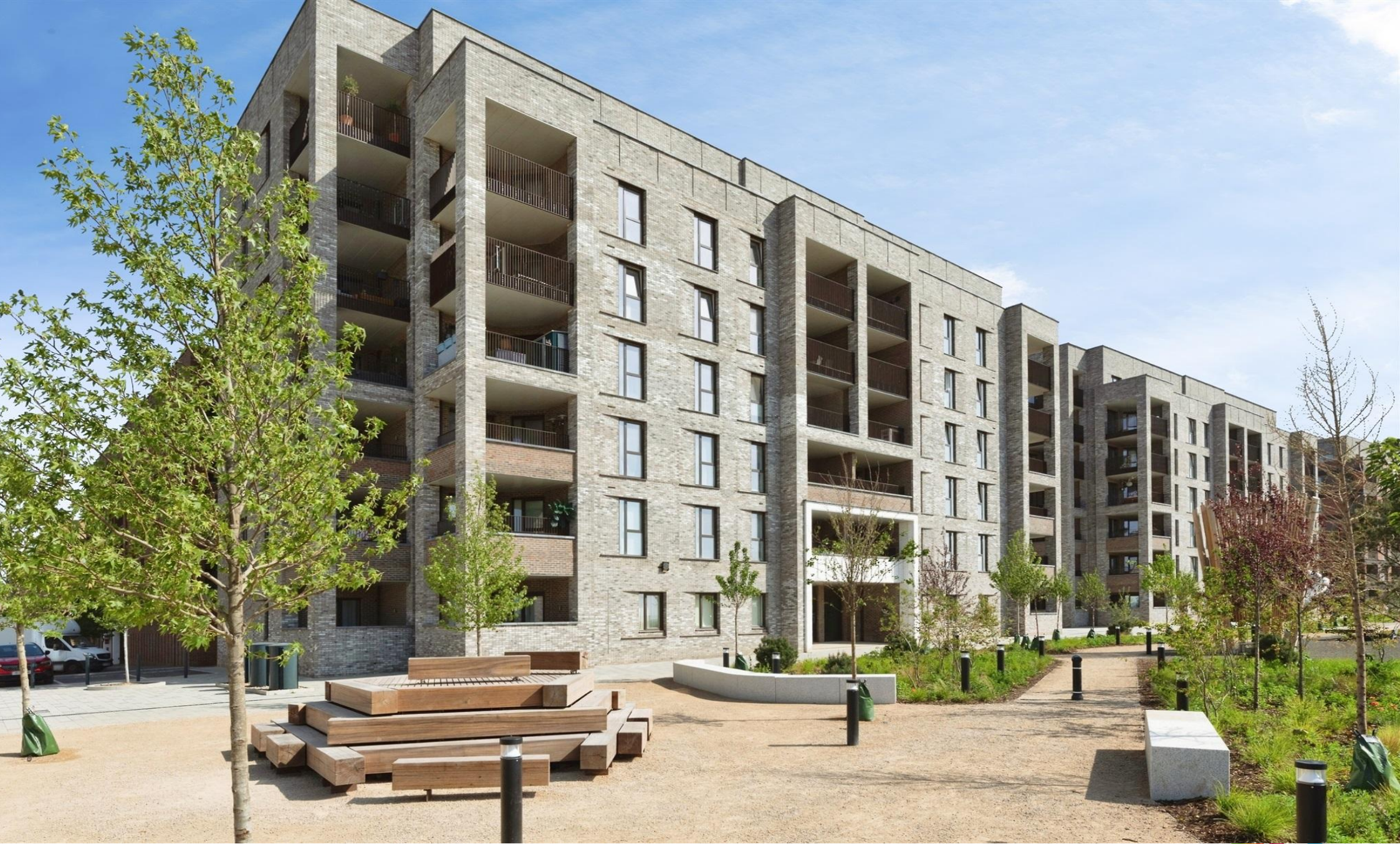
O'leary Mansions, Kings Hill, Barking, IG11 0BT