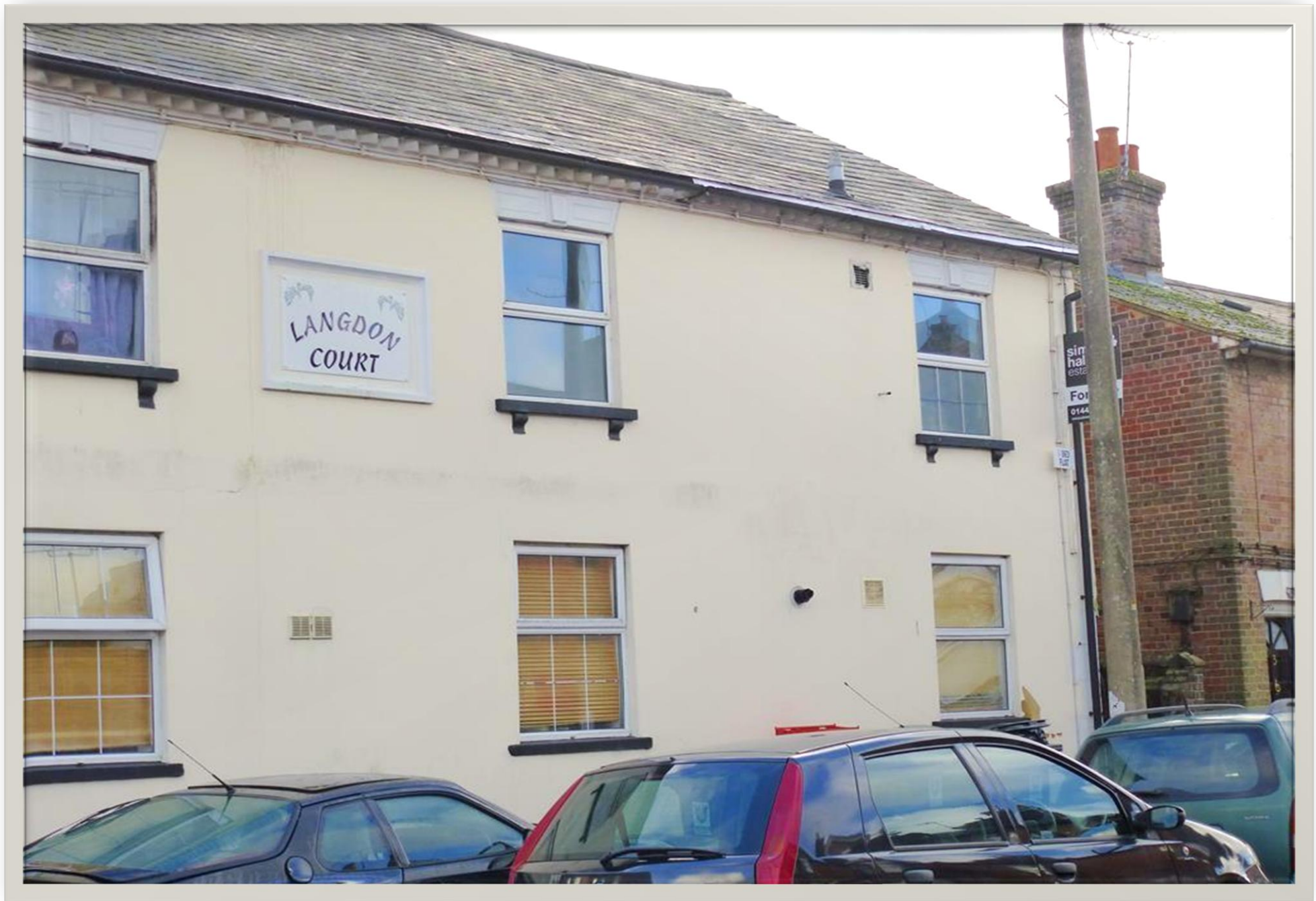
LANGDON COURT CHARLES STREET TRING HP23 6SD