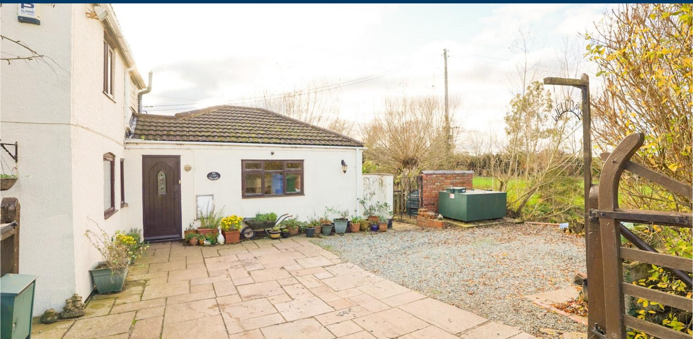
Ivy Cottage Great North Road, Tuxford, NG22 0NE