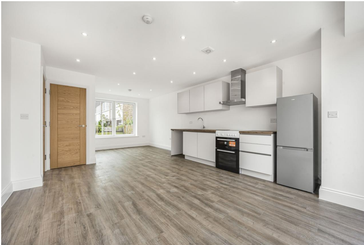
6 Forge Close, Caversham, Reading, RG4 8BG Price £450,000 Freehold

Masons are proud to offer to the market this newly built two bedroom end terrace, located in Caversham and within a short walk of Caversham & Reading centres, along with Reading mainline station. The property has been built to a high specification and has an EPC energy rating of B. The property benefits from a 24ft open plan kitchen/living/dining area with bi-folding doors opening to the garden, a downstairs cloakroom, an air source heat pump, a 15ft master bedroom and an 11ft bedroom two. Further benefits include a first floor bathroom, an airing cupboard, a private rear garden and a bike store to the front of the property. Viewing recommended.