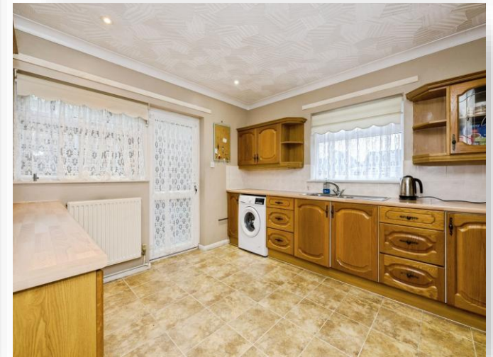
Westfield Road, Yaxley Peterborough PE7 3LG