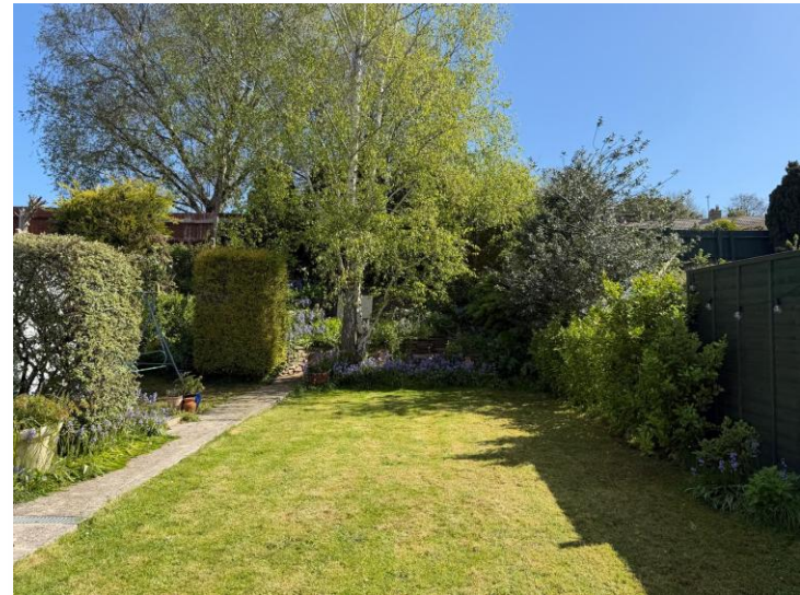
Foxbury Close, Frome, BA11 2LZ