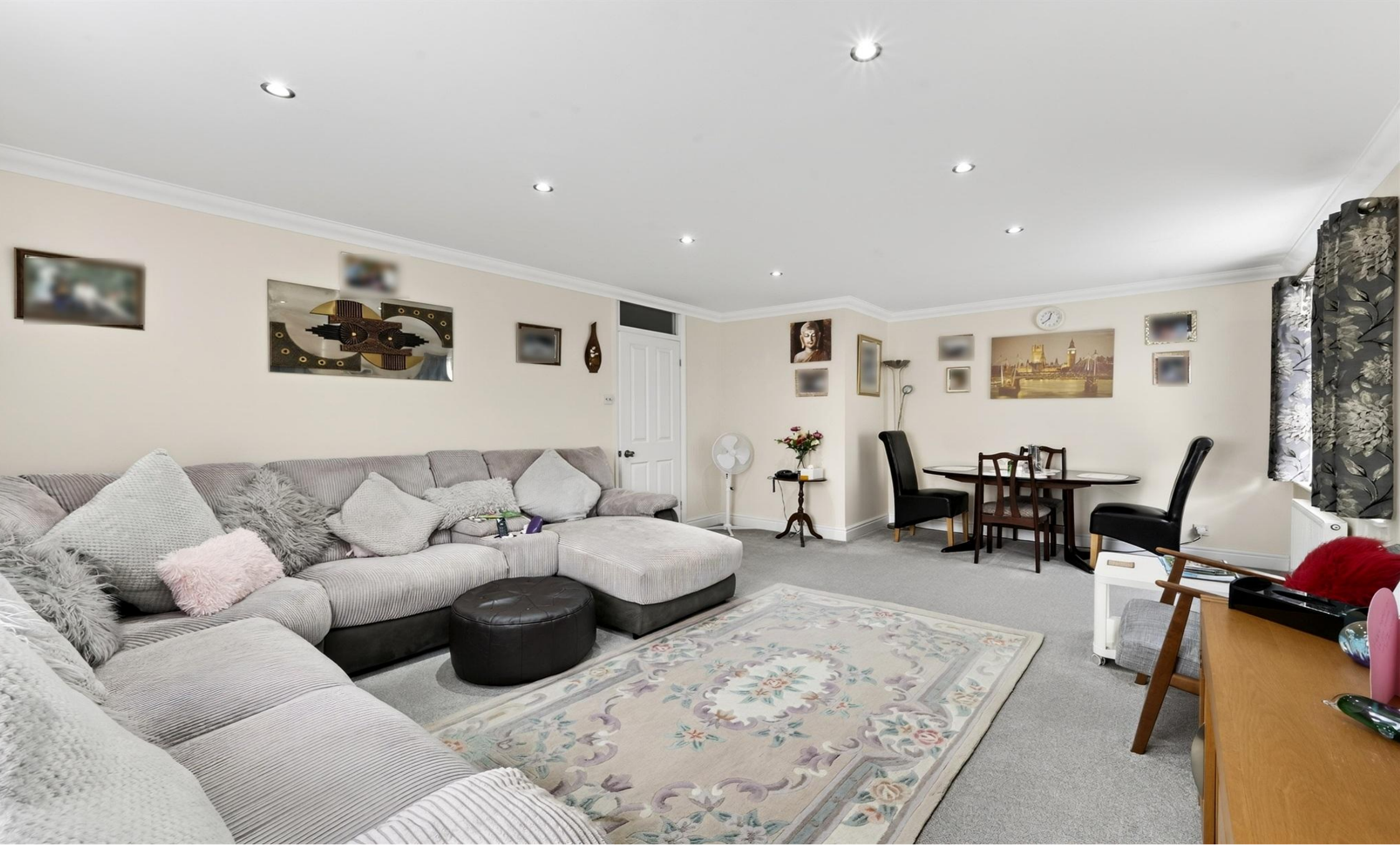
Caernarvon Court Surbiton Hill Park, Surbiton KT5 8EX