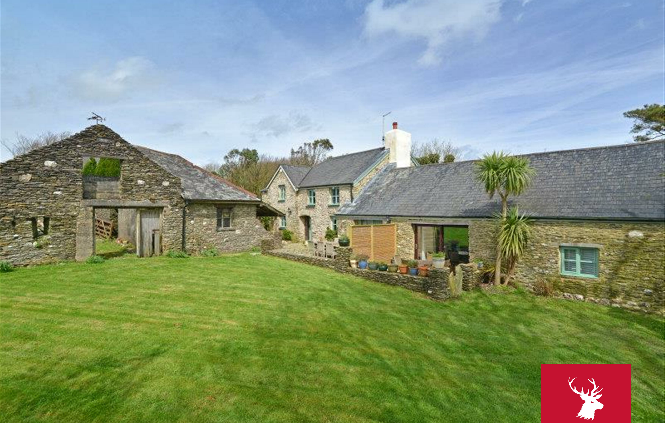
Inner Narracott & The Old Dairy