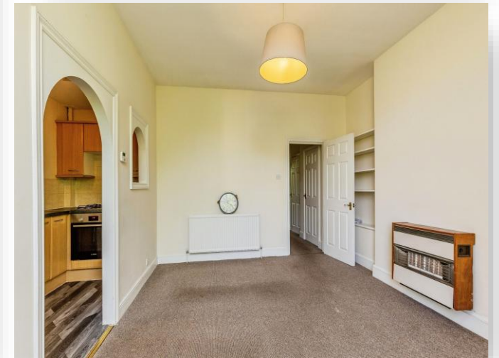
Hall Floor Flat Aberdeen Road, Redland Bristol BS6 6HT