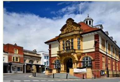
Marlborough Town Hall