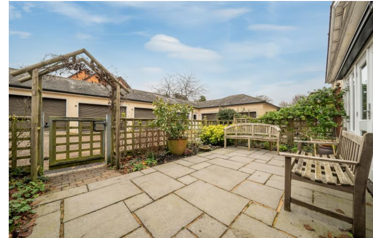
Rear with garden

Approximate Gross Internals: m 2 97.2/1047 ft 2 Service Charge: £9,000pa Energy Performance Rating: (D) Council Tax Band: