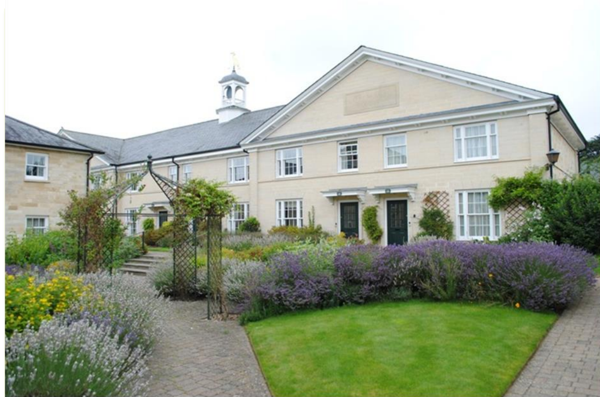
The gardens/grounds at St Luke's