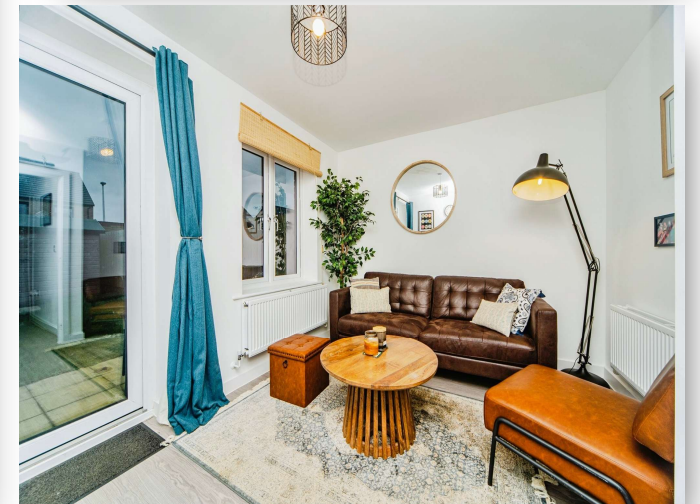
Maes Yr Ysgol, Rumney Cardiff CF3 3NL