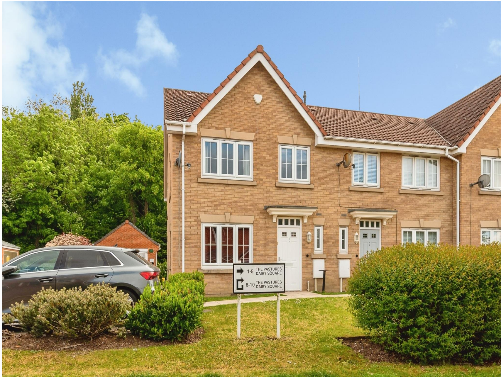
The Pastures, Nottingham NG8 3DY