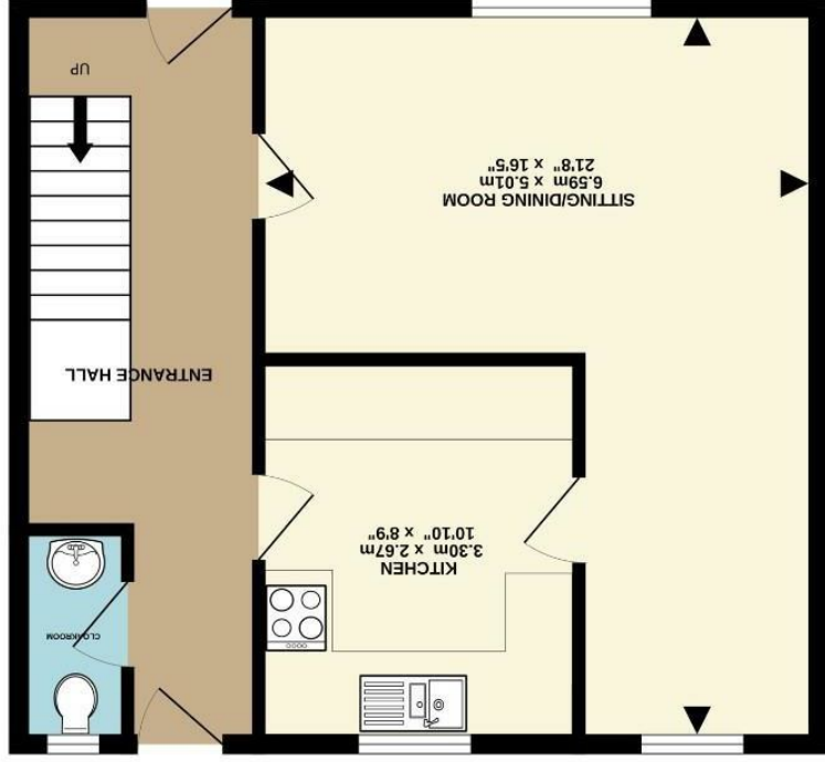
GROUND FLOOR 47.2 sq.m. (508 sq.ft.) approx.

TOTAL FLOOR AREA : 93.8 sq.m. (1010 sq.ft.) approx. Whilst every attempt has been made to ensure the accuracy of the floorplan contained here, measurements of doors, windows, rooms and other items are approximate and no responsibility is taken for any error, omission or mis-statement. This plan is for illustrative purposes only and should be used as such by any prospective purchaser. The services, systems and appliances shown have not been tested and no guarantee as to their operability or efficiency can be given. Made with Metropix ©2026