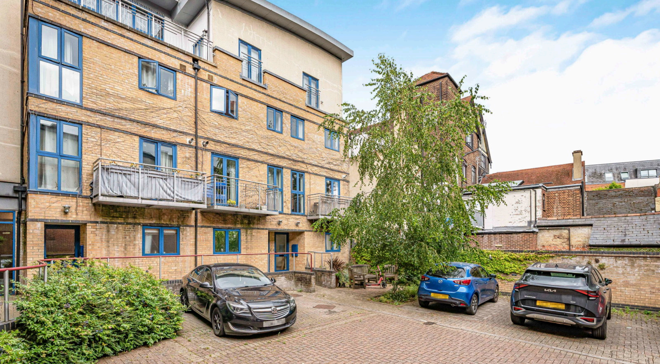
The Galleries, Dovecot Road, High Wycombe, HP13 5HR