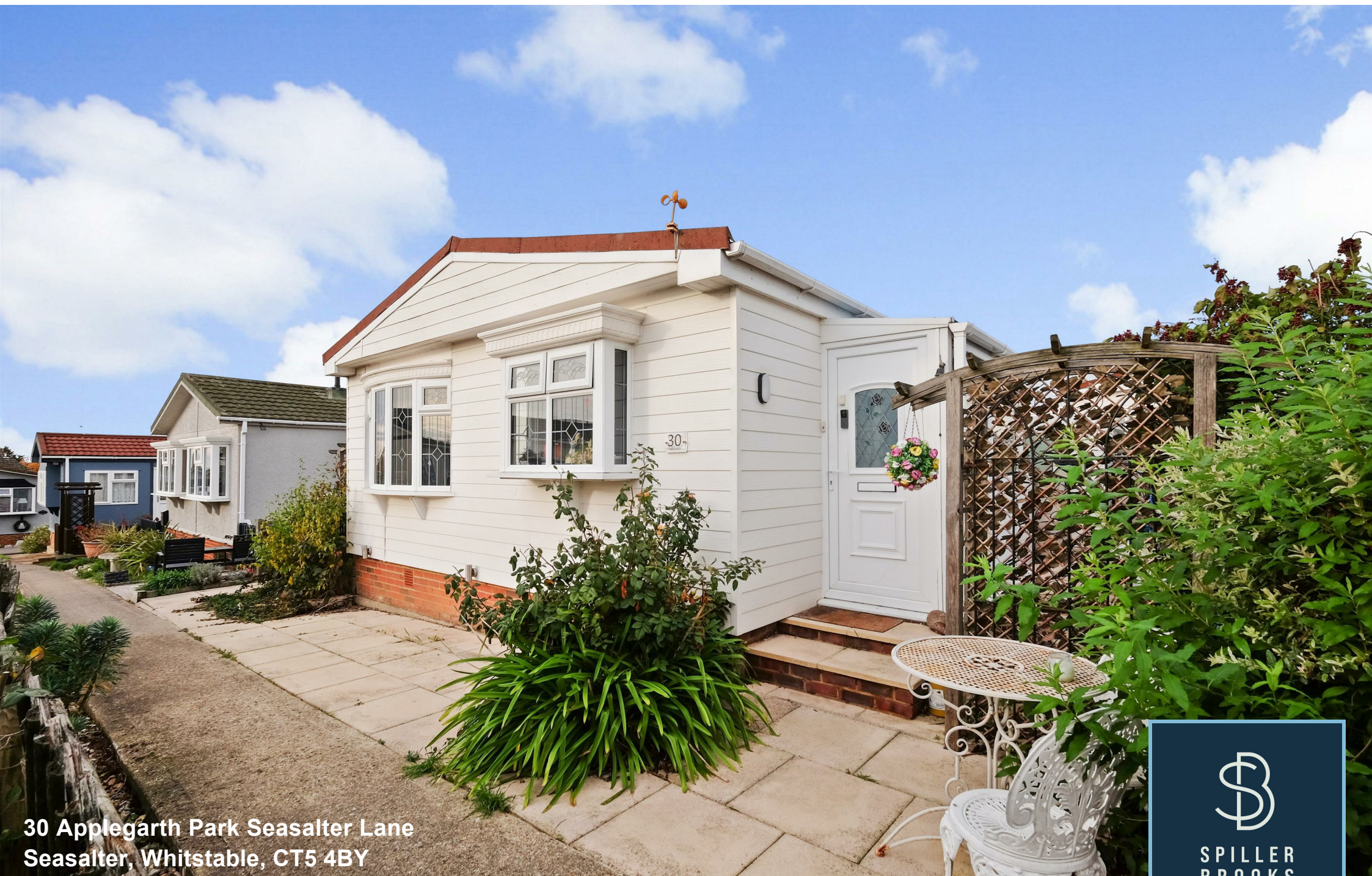
30 Applegarth Park Seasalter Lane Seasalter, Whitstable, CT5 4BY