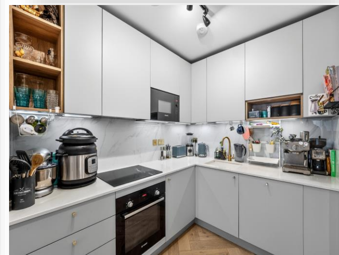
Garrett Apartments, Ravensbury Terrace, London SW18 4SB