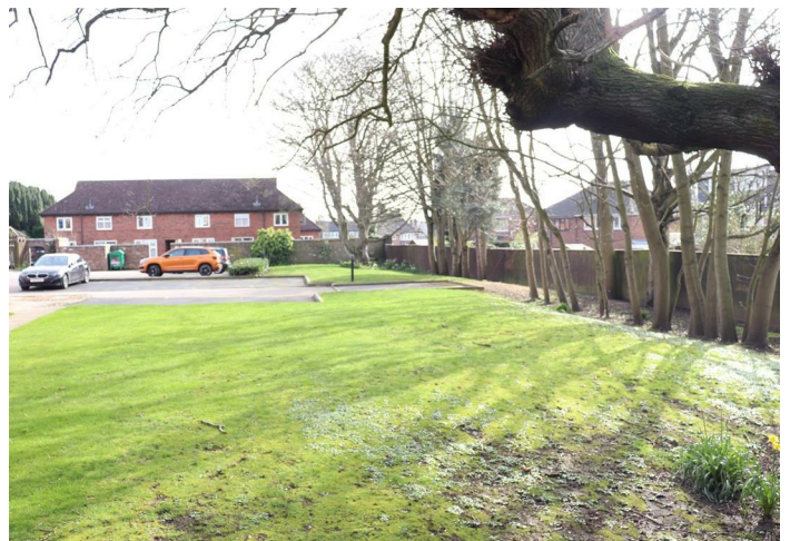
Communal Grounds and Parking