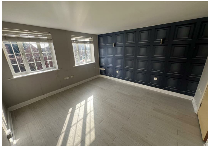
Open Plan Living / Fitted Kitchen Area