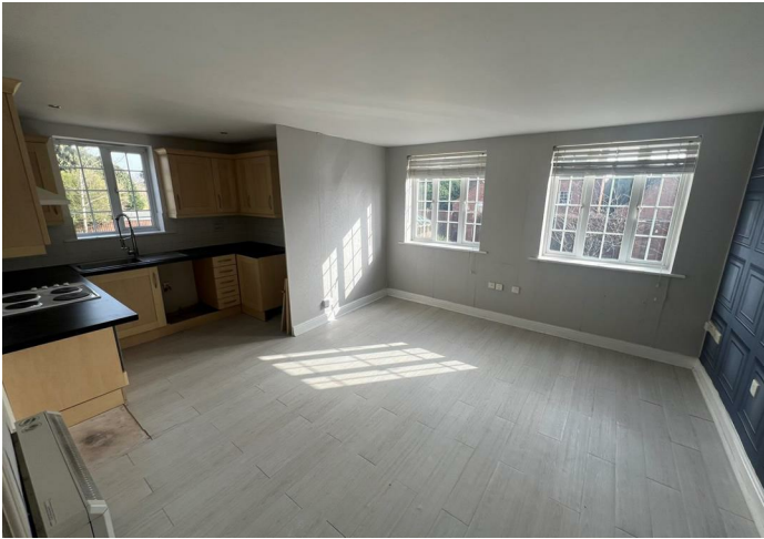
Open Plan Living / Fitted Kitchen Area