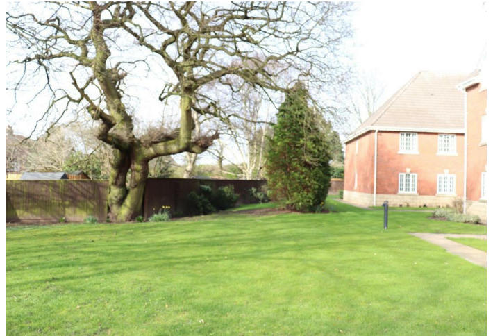
Communal Grounds and Parking