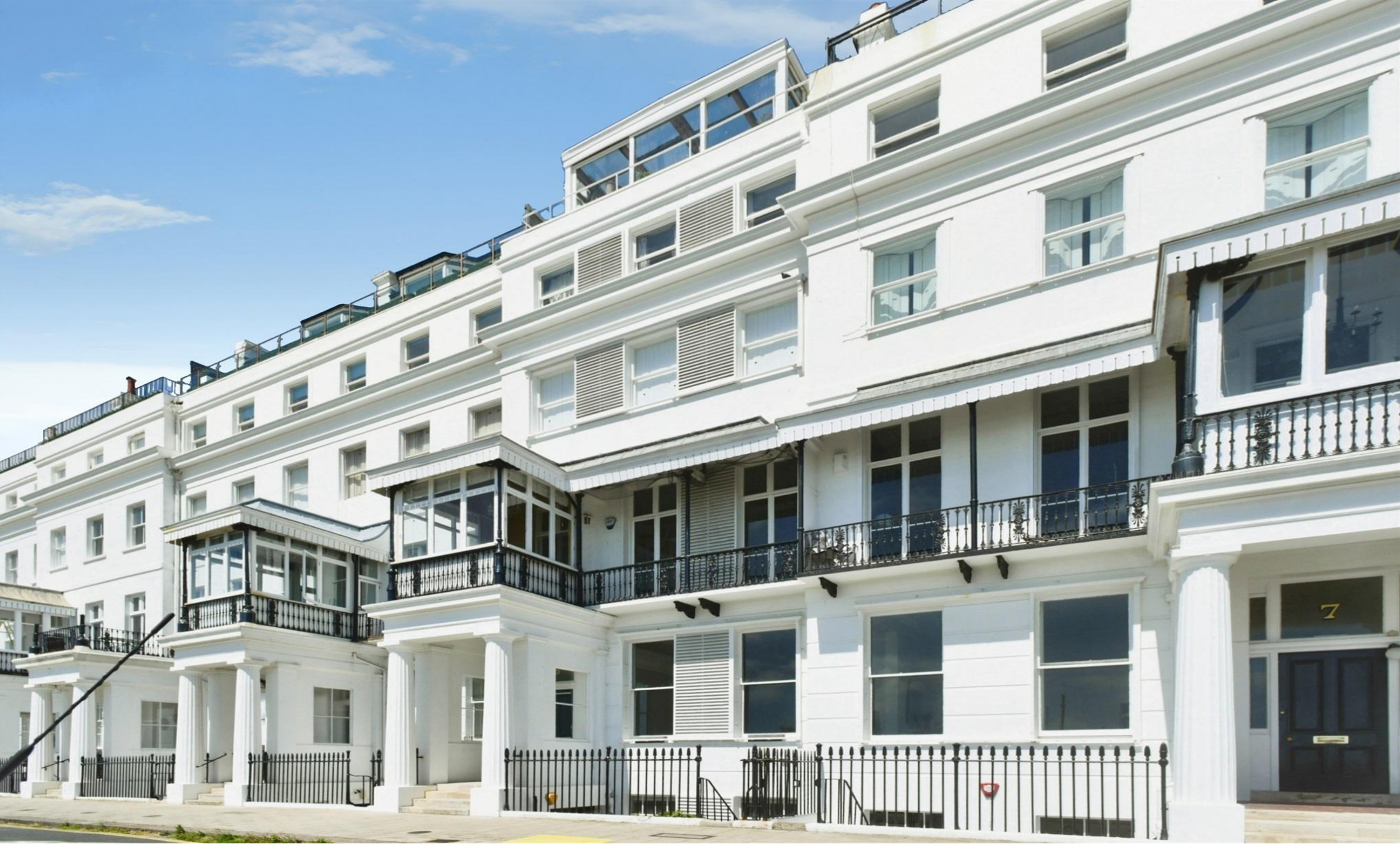
Chichester Terrace, Brighton BN2 1FG