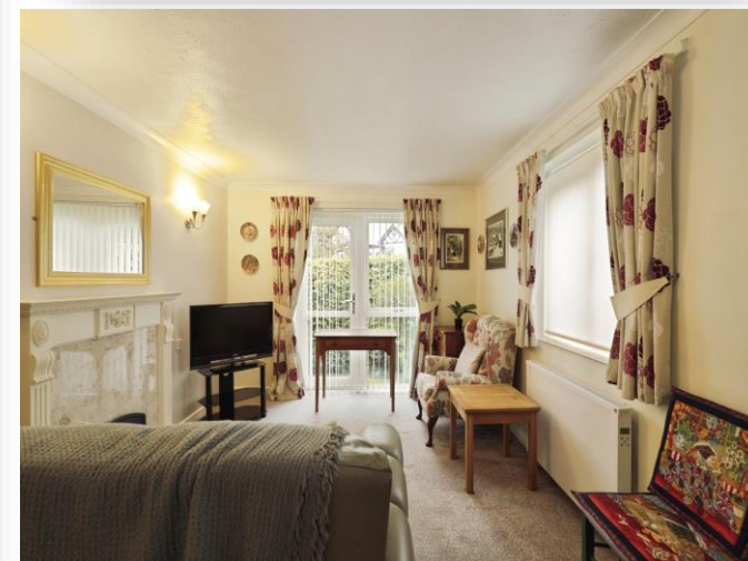
Arthington Court East Parade, Harrogate HG1 5LH