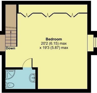
ANNEXE FIRST FLOOR