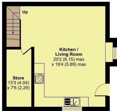
ANNEXE GROUND FLOOR