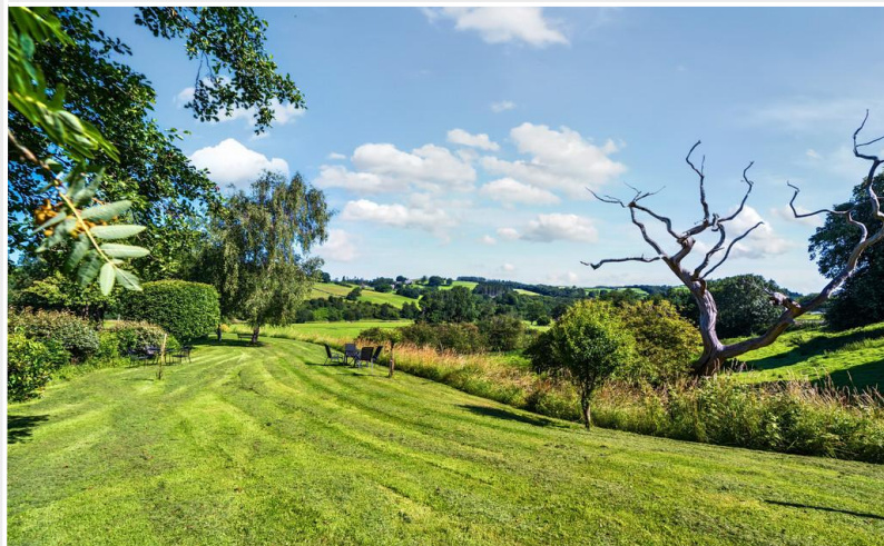
Gardens & Grounds