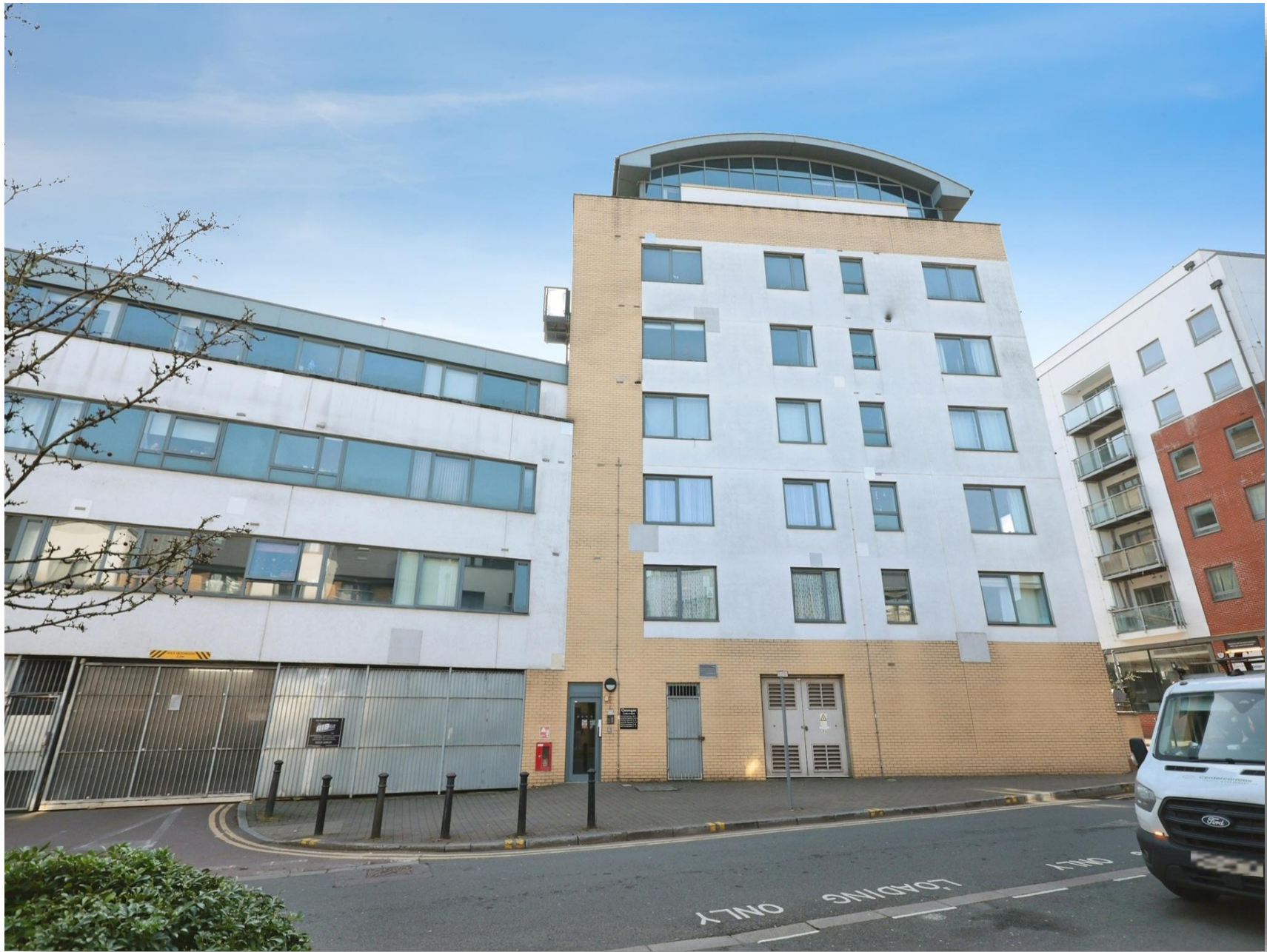
Queens Gate, Lord Street, Watford, WD17 2LQ