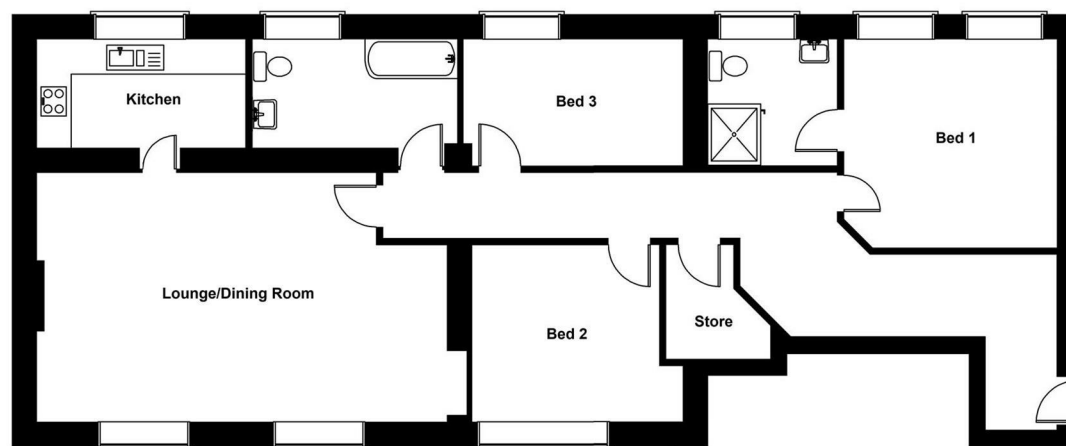
SKETCH PLAN FOR ILLUSTRATIVE PURPOSES ONLY All measurements walls, doors, windows, fittings and appliances, their sizes and locations, are approximate only. They cannot be regarded as being a representation by the seller, nor their agent.