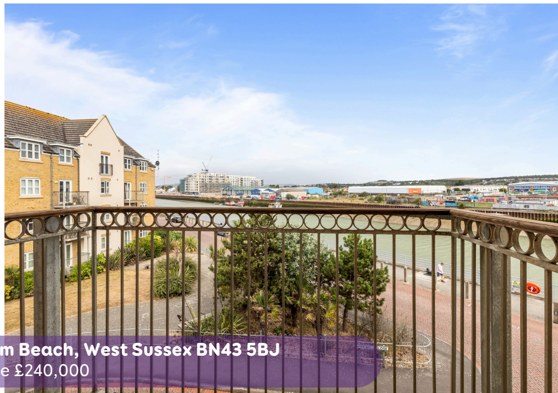
Newport, Sussex Wharf, Shoreham Beach, West Sussex BN43 5BJ Guide Price £240,000