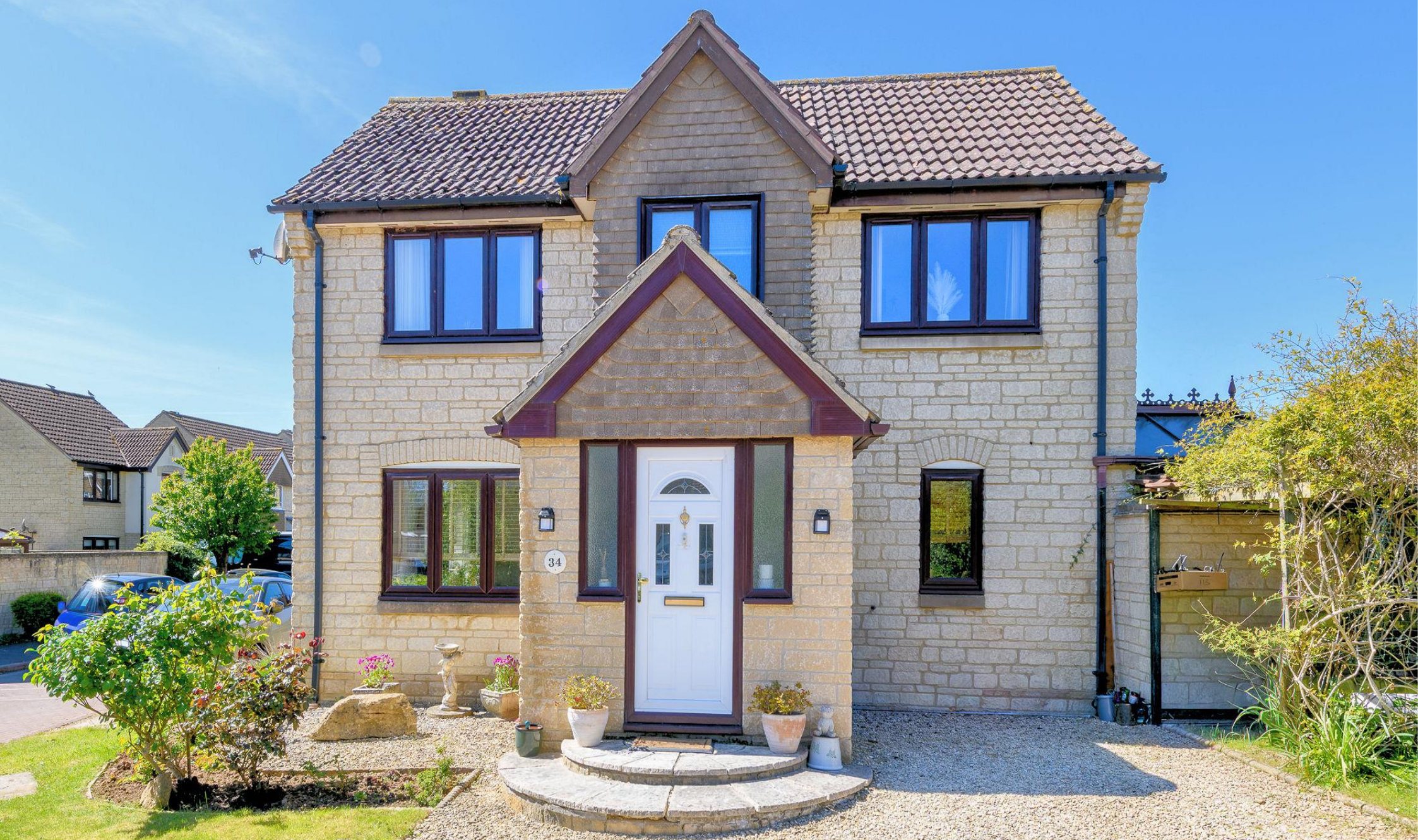
34 The Old Batch Bradford on Avon, Wiltshire, BA15 1TL